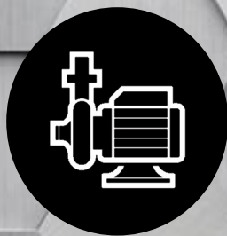
4x Pump Sets