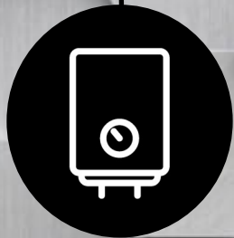
Boilers / Heat Pumps